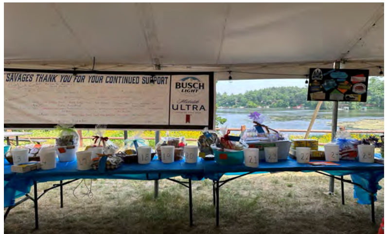
Lots of donations, baskets, fun, and smiles!!!!